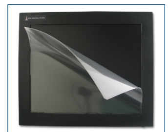
Optional Screen Protector guards touch screens from scratches and wear.