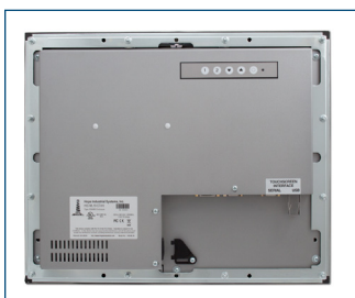
Rear view of 19" Panel Mount Monitor.