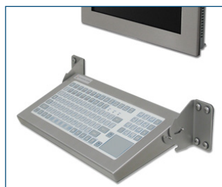
Panel Mount workstation configuration with monitor and industrial keyboard.