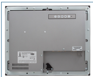
Rear view of 19" Panel Mount Monitor.