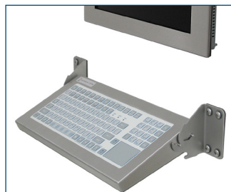
Panel Mount workstation configuration with monitor and industrial keyboard.