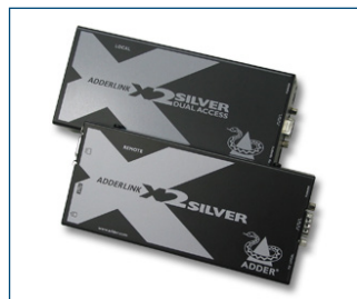
Optional KVM Extender allows monitor to be placed up to 1000' away from computer.