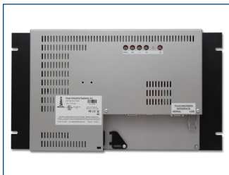
Rear view of 15" Rack Mount Monitor.