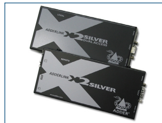
Optional KVM Extender allows monitor to be placed up to 1000' away from computer.