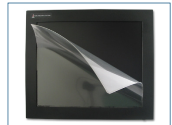
Optional Screen Protector guards touch screens from scratches and wear.